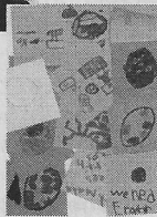
Sample 1st Grade Collage Art

Awesome Teachers & Awesome Students 2014